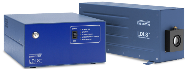
LDLS™ Laser-Driven Light Source, shown with remote power supply

Energetiq's innovative Laser-Driven Light Source (LDLS™) technology uses a CW laser to directly heat a Xenon plasma to the high temperatures necessary for efficient deep ultraviolet production. In traditional approaches such as arc and deuterium lamps, the brightness, UV power, and lamp lifetime are limited by the use of electrodes to couple power to the plasma. The electrodeless LDLS technology creates small, high brightness plasma that allows efficient light collection, broad spectral range from the deepest UV through visible and beyond, and long lamp life.